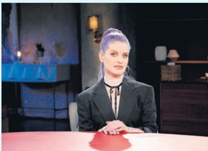
This image released by Red Table Talk shows TV personality Kelly Osbourne, who will appear in an episode of the talk show series to discuss her battle with drug and alcohol addiction. The episode will be available on Wednesday, June 2 on Facebook Watch.